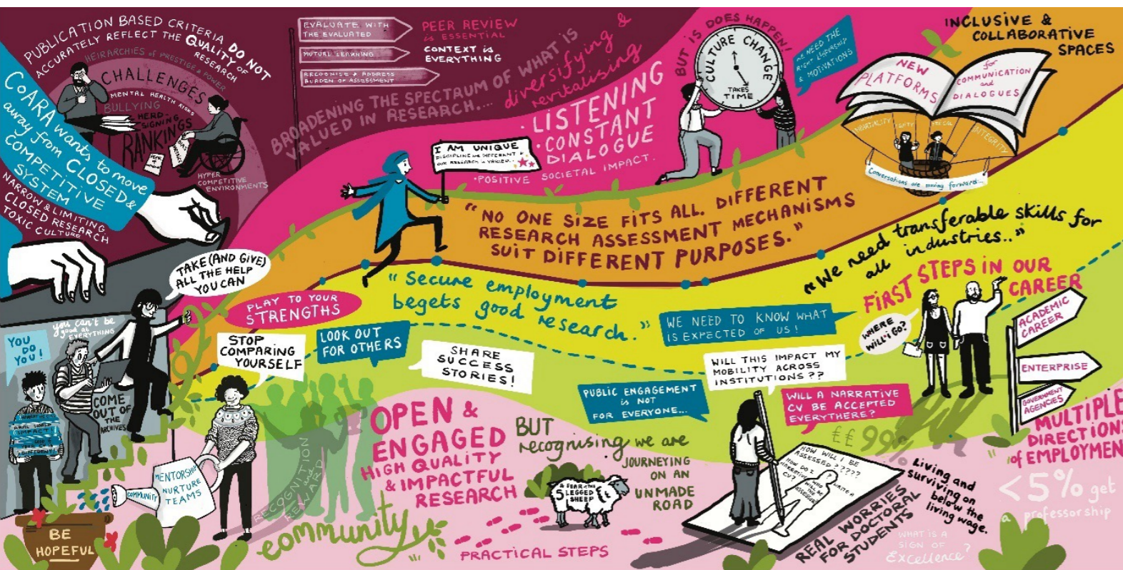
○ Illustration by Beth McComish

The work of the CoARA National Chapter is based on the Agreement of Reforming Research Assessment (2022) and is part of a broader global coalition that aims to work together to implement such changes. At a national level, their work is supported by Ireland's commitment to implement research assessment reform, one of the actions in the European Research Area (ERA) Policy Agenda (2022 – 2024) , as well as via Action A3.3 ' Align research assessment with the principles of open research ' in Ireland's National Action Plan for Open Research 2022 – 2030 .